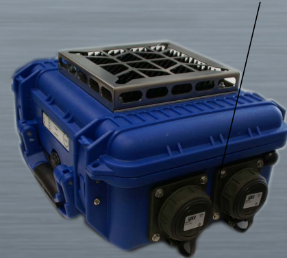
Power Inverter Case