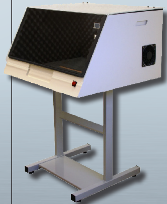
SOUNDPROOFING COVER with SC 1 STAND option

> Please contact us to find out which of our soundproofing covers are suitable for your printer