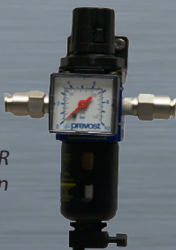
PRESSURE REDUCER option