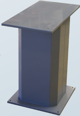
MONOBLOC STAND option

The protection system for large format thermal printers