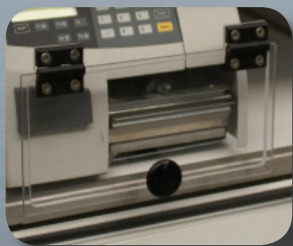
Slot TAV model