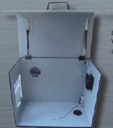
Inner view of the TGC: Ventilation grilles on the side and ECA with switch on the rear