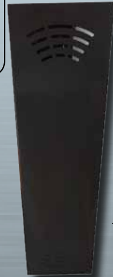
PI TV side view 2 natural ventilation