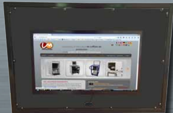
PI TV with anti-reflective window