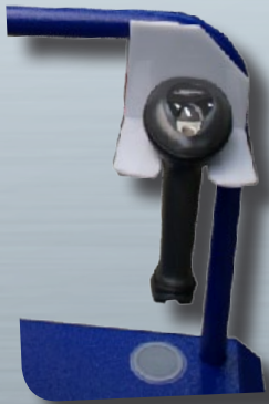
PISTOL GRIP MOUNT