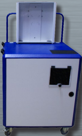
LOGIRACK LCD with printer on extended shelf and PISTOL GRIP MOUNT