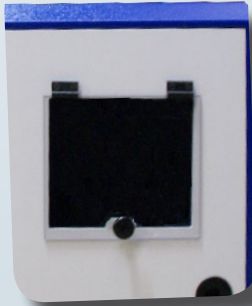
TAV L24 slot

The mobile protection solution for all your computer workstations