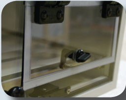
L 12 Slot

The mobile protection solution in stainless steel for all your computer workstation