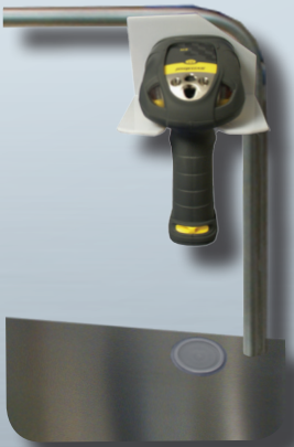
PISTOL GRIP MOUNT