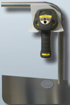
PISTOL GRIP MOUNT