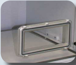
L 12 Slot

The mobile protection solution in stainless steel for all your computer workstation