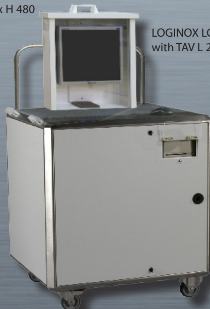
LOGINOX LCD with TAV L 24 hatch