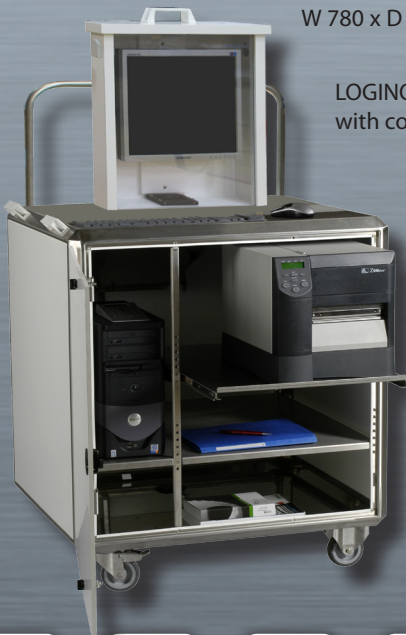
LOGINOX LCD with computer hardware