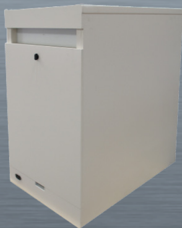
ISS 1: rear view