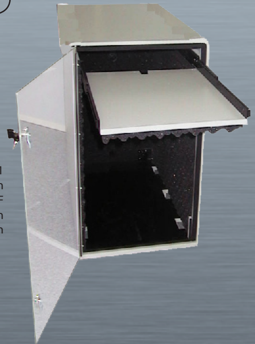
ISS 1 with KEYBOARD SHELF option and LOCK option