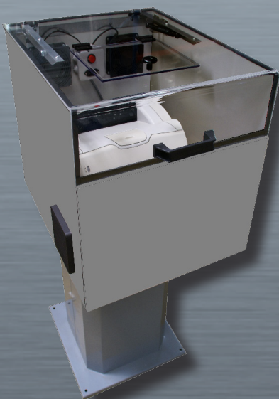
IL 20 with LEGS option SINGLE UNIT and TAV LASER and option ECA