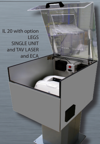
IL 20 with option LEGS SINGLE UNIT and TAV LASER and ECA