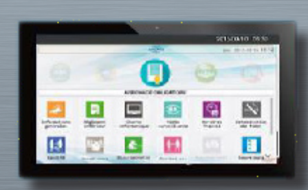
Touch Tablet All in One to integrate