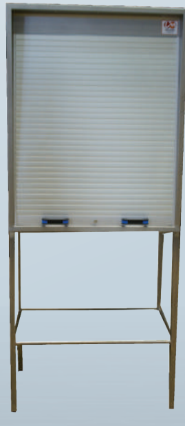
2 handles to make the use easier