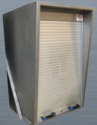
AGRO PM closed rolling shutter + option WALL MOUNTING