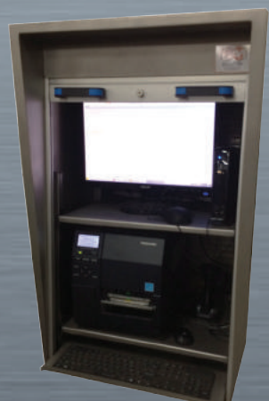
2 extractables shelves