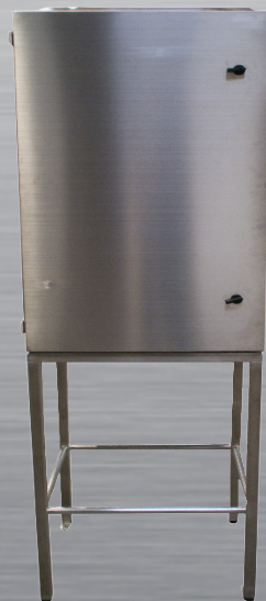
AGRO INOX LC closed door Sloping roof