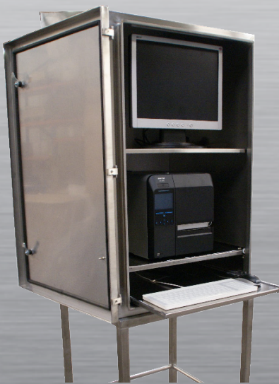
AGRO INOX LC opened with extracted keyboard shelf