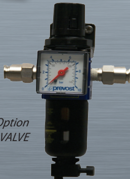
Option PRESSURE-RELIEF VALVE