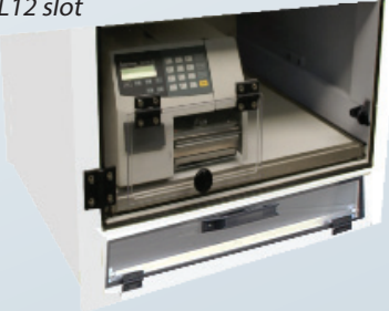
TAV L12 slot