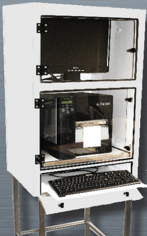
CPA3 with shelf for keyboard extended